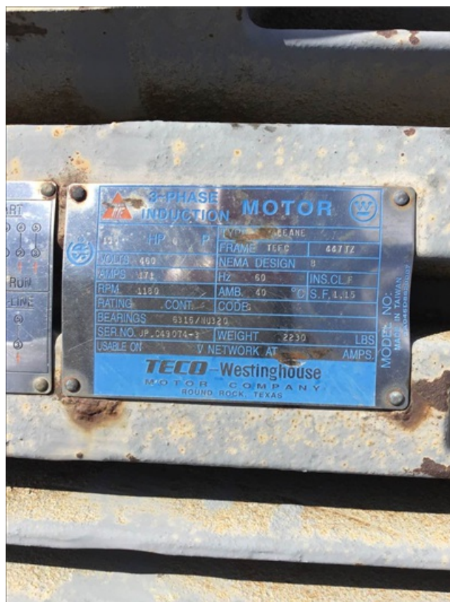
PRIME MOVER SERIAL NUMBER