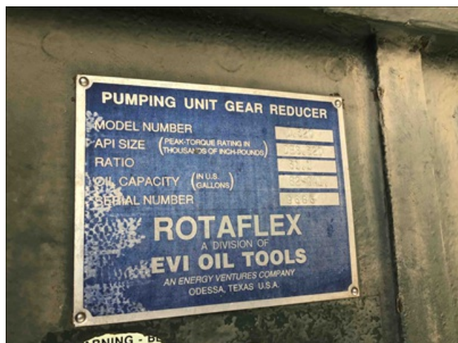
GEAR REDUCER SERIAL NUMBER