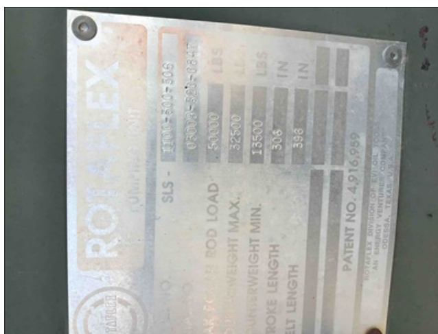
UNIT SERIAL NUMBER